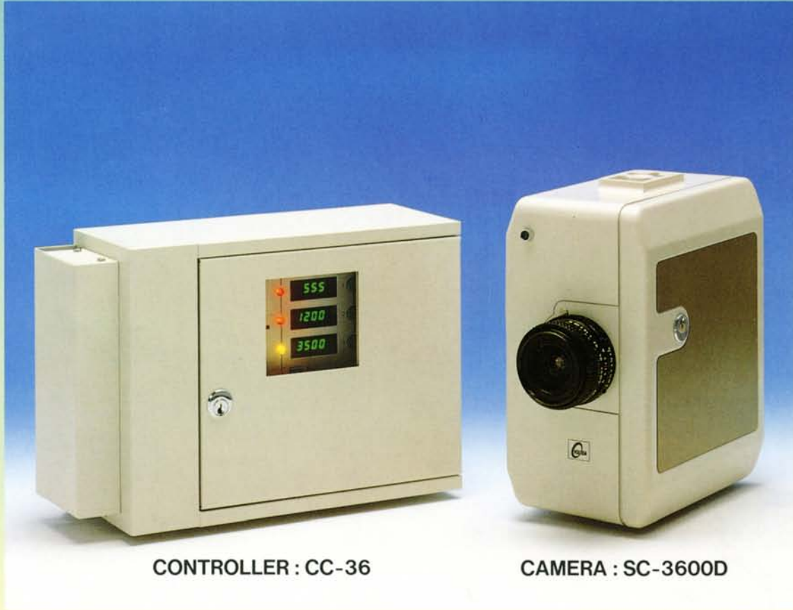
CONTROLLER : CC-36